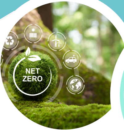
Fighting climate change